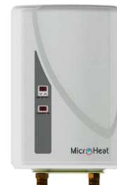
CFEWH Series 2 Premium